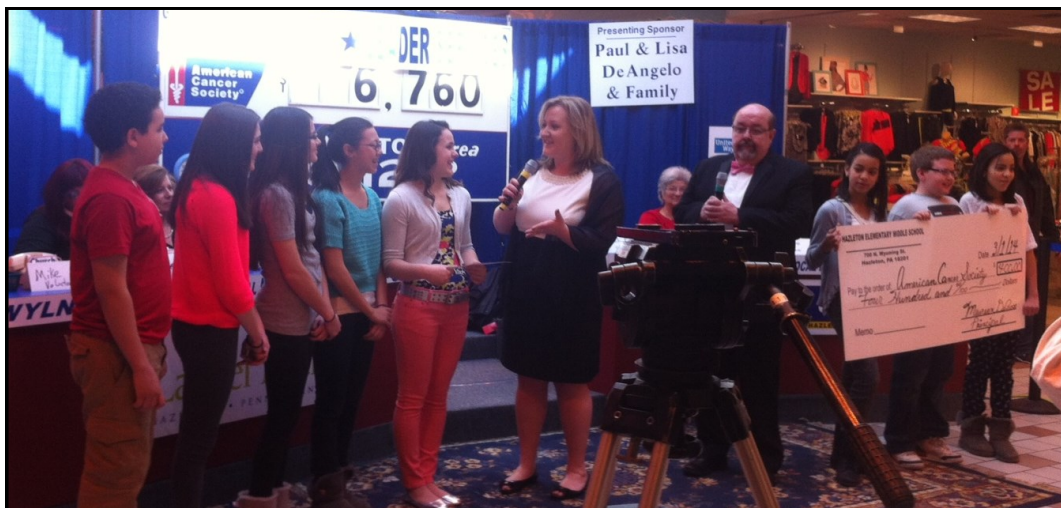
(Above): Community Service and student council members raised money for the American Cancer Society. A check was presented to the ACS on March 1, 2014.